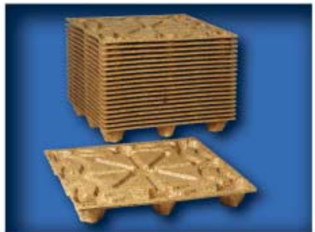
F11 1140x1140 mm 900 kg Capacity 1250 kg Capacity - ref F11/S