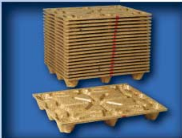
F10/2 1000x1200 mm 900 kg Capacity 1250 kg Capacity - ref F10/2S