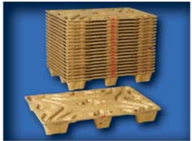
F8LF2 800x1200 mm 900 kg Capacity 1250 kg Capacity - ref F8LF2/S