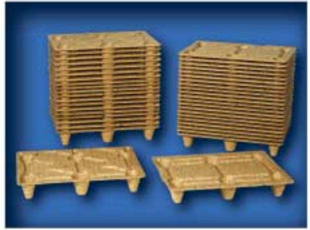
F64 600x800 mm 500 kg Capacity 1000 kg Capacity - ref F64/S