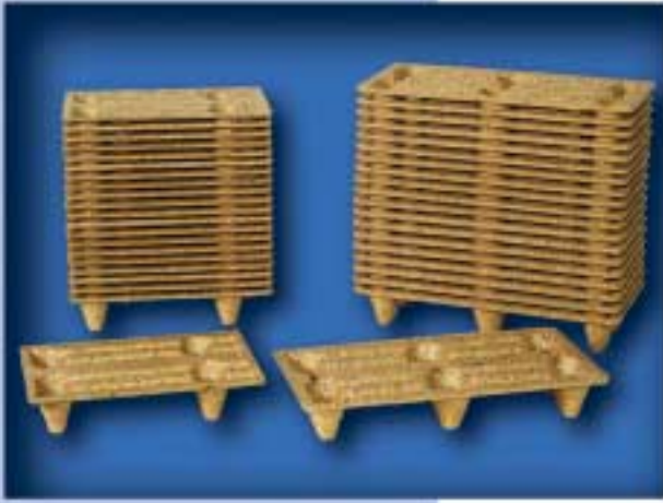
F44 400x600 mm 250 kg Capacity